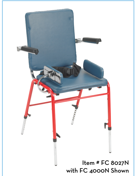
Item # FC 8027N with FC 4000N Shown