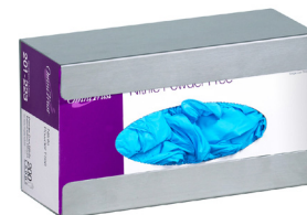
Shown in the horizontal position

*Clinton stainless steel items are not M.R.I. compatible.