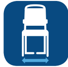
Total width ▼