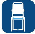
Seat width ▼