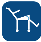
Tilt angle seat ▼