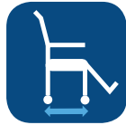
Seat depth ▼