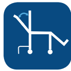
Tilt angle back ▼