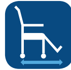
Total depth ▼