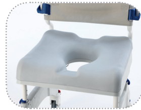
Seating and Backrests