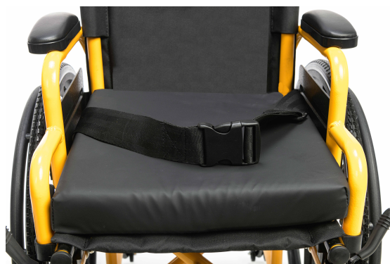
Cushion & Seat Belt