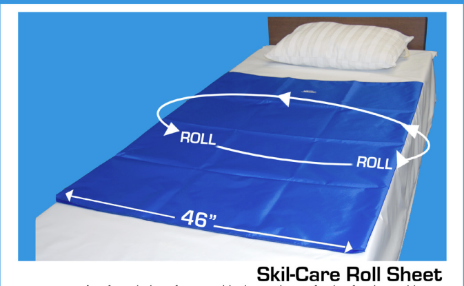
A safe technique for repositioning and transferring for the residents