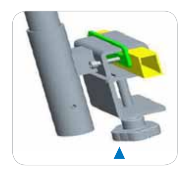
Rectangular Tube Bed Frame