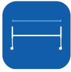
Bed Deck Length ▼