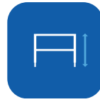
Minimum/Maximum Bed Deck Height ▼