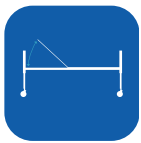
Maximum Back Angle ▼