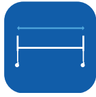
Overall Length (incl. head/foot boards) ▼