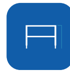
Width Extension ▼