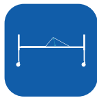
Maximum Knee Angle ▼