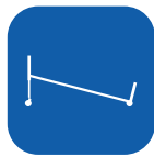
Maximum Reverse Trendelenburg ▼