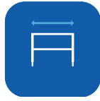
Bed Deck Width ▼