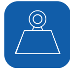
Maximum Safe Working Load ▼